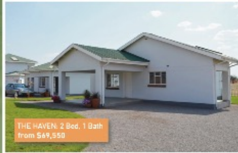
THE HAVEN: 2 Bed, 1 Bath from $69,950