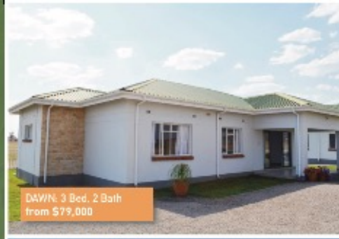
DAWN: 3 Bed, 2 Bath from $79,000