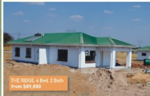
THE RIDGE: 4 Bed, 2 Bath from $89,880