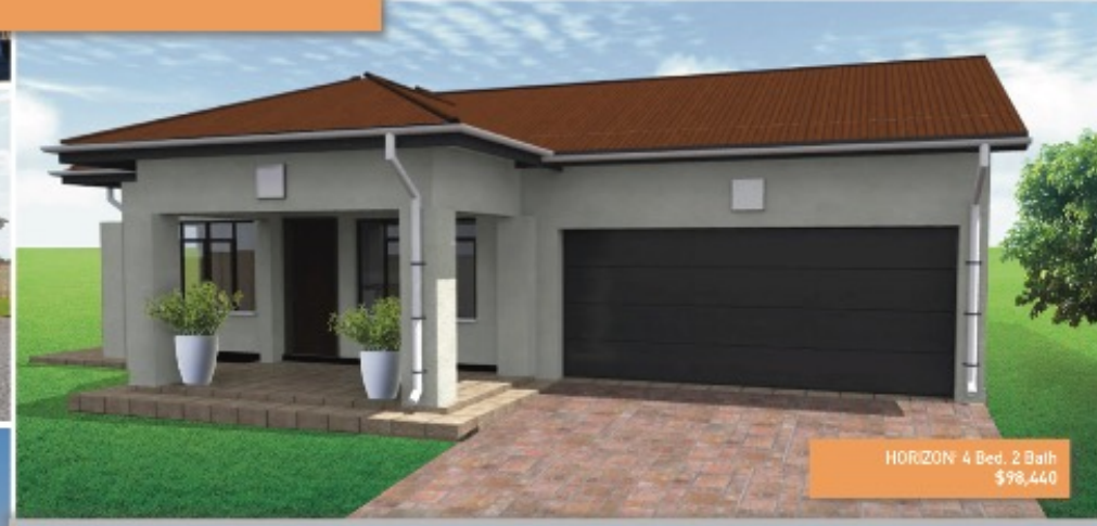
HORIZON: 4 Bed, 2 Bath $98,440