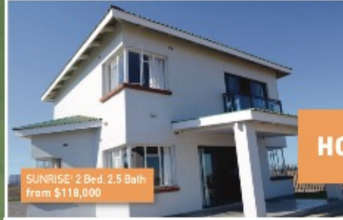
SUNRISE: 2 Bed, 2.5 Bath from $118,000