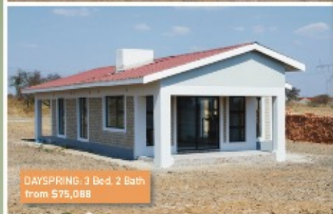
DAYSRING: 3 Bed, 2 Bath from $75,088